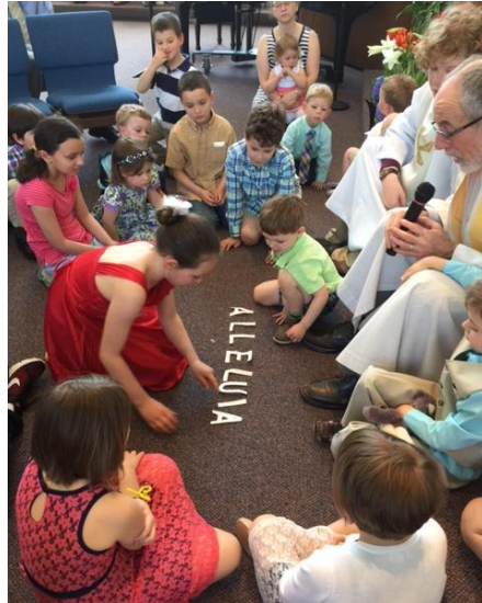
The Return of "Alleluia"! Easter Sunday - April 16, 2017